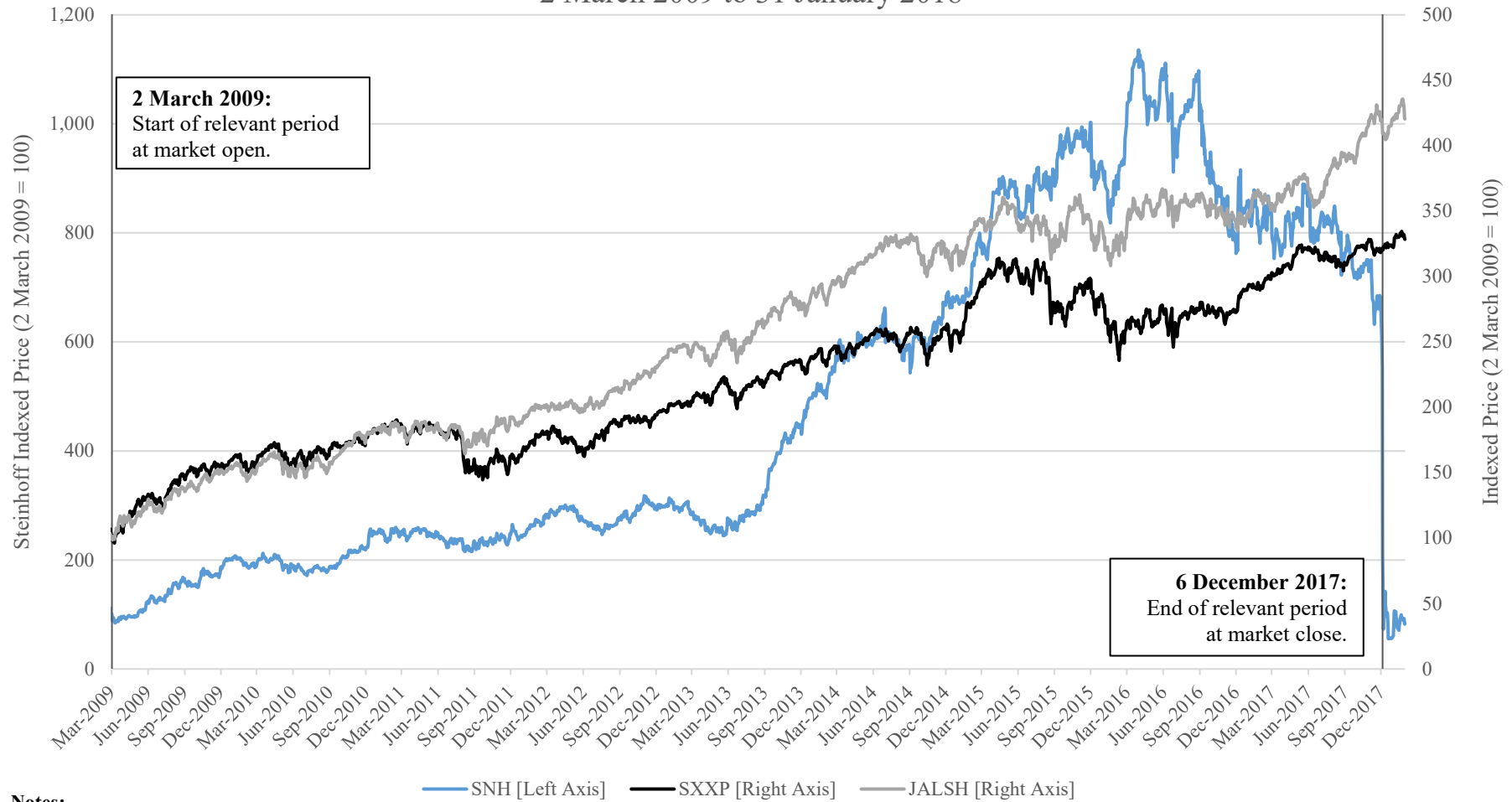
Exhibit 1 Indexed Steinhoff (JSE), SXXP, and JALSH Prices 2 March 2009 to 31 January 2018